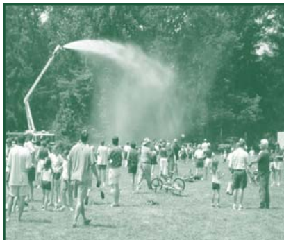
Cooling off at an earlier Biltmore Forest Independence Day Picnic